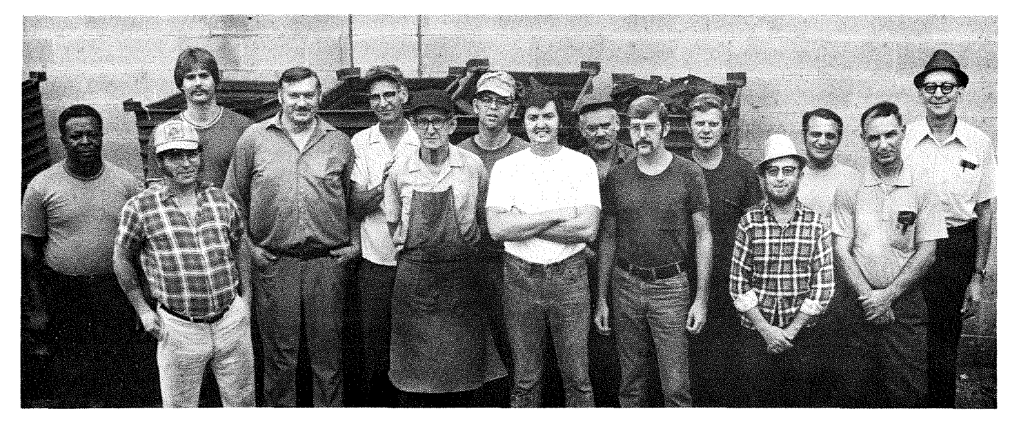
Representing the three shifts which make up Team 12 (Foundry, Heat Treat, Core Room, Cleaning Room) is the first shift gang. Team 12 took first place safety honors in May with the best improvement rate. Congratulations!